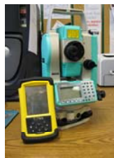
Total Station is blue, RECON is yellow.

The Total Station recently needed to be replaced and